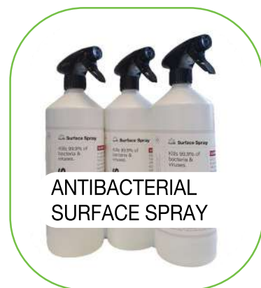
ANTIBACTERIAL SURFACE SPRAY