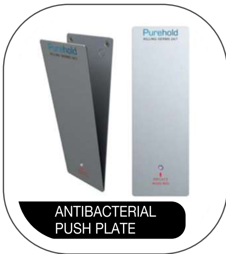
ANTIBACTERIAL PUSH PLATE

An antibacterial door push plate that kills 99.9% of bacteria using silver ion technology to ensure the plate is clean to touch. Simple to fit and remove without any tools.