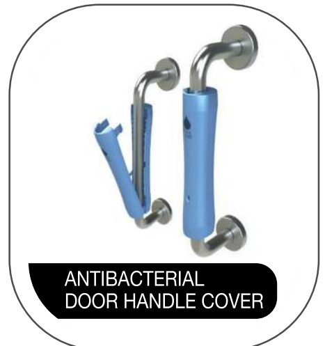
ANTIBACTERIAL DOOR HANDLE COVER

Antibacterial door handle covers that kills 99.9% of bacteria using silver ion technology to ensure the handle is clean to touch. Simple to fit and remove from most lever door handles without any tools.