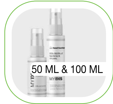
50 ML & 100 ML

QUICK KILLING ACTION THAT IS KIND TO THE SKIN