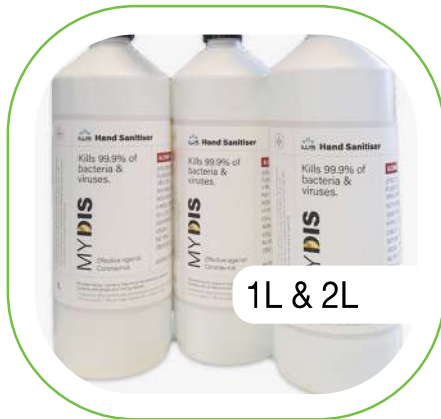
1L & 2L

QUICK KILLING ACTION THAT IS KIND TO THE SKIN