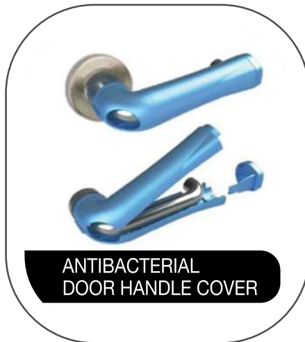
ANTIBACTERIAL DOOR HANDLE COVER

An antibacterial door push plate that kills 99.9% of bacteria using silver ion technology to ensure the plate is clean to touch. Simple to fit and remove without any tools.