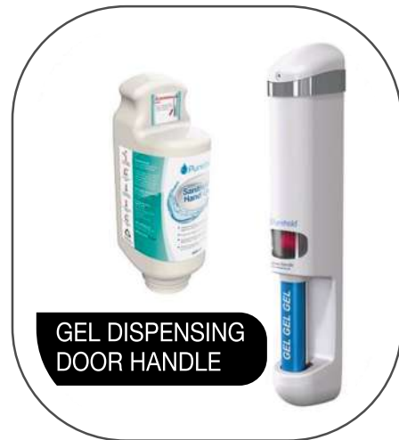
GEL DISPENSING DOOR HANDLE

Don't compromise on door hygiene with our Antibacterial door plates, handle covers, and gel dispensing door handles.