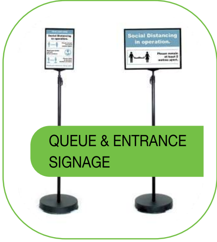
QUEUE & ENTRANCE SIGNAGE